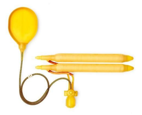
Three-piece inflatable implant

A penile implant is a surgically implanted device used for erectile dysfunction when medications and other methods are not enough. There are two types of penile implant: the 3-piece inflatable implant and the malleable implant. The inflatable penile prosthesis consists of two attached cylinders -- a reservoir and a pump -- which are placed surgically in the body. The two cylinders are inserted in the penis and connected by tubing to a separate reservoir of saline. A pump is also connected to the system and sits under the loose skin of the scrotal sac, between the testicles. This system is inflated and deflated on demand by the patient and produces a natural looking and rigid erections and is concealable when it is deflated or flaccid. The malleable implant consists of two thick, bendable rods that are surgically placed within the penis. This implant causes a permanent rigid or erect state that is not as easily concealed and is never flaccid.